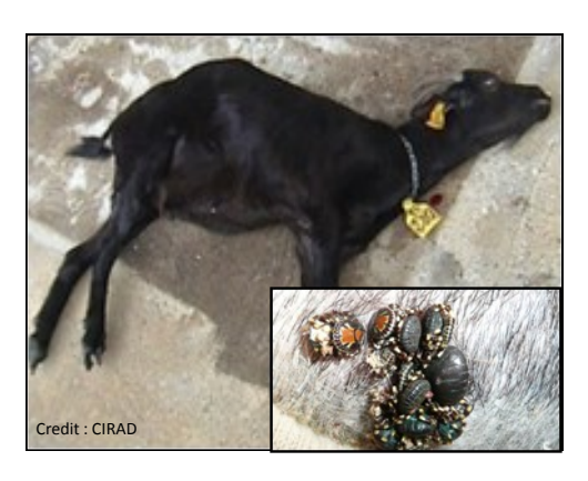
Picture : The project include passive surveillance of Heartwater, based on clinical signs and detection of Amblyomma variegatum.