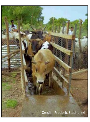
Picture : Experimental footbath in Burkina Faso, to control ticks infestation.