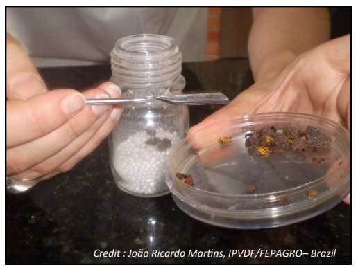
Picture : Cattle ticks eggs collection and isolation: essential step for the Larval Tarsal Test (LTT).

Map : planned activities in the differents partners countries.