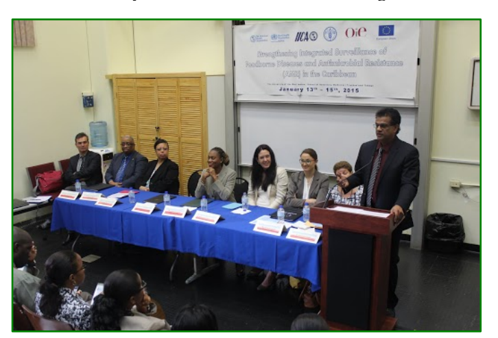
Opening of the AMR Regional Workshop