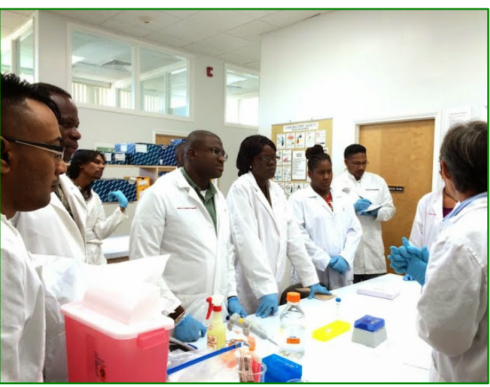
Participants engaged at the training workshop on "Laboratory Methods for Rabies Virus Diagnosis"