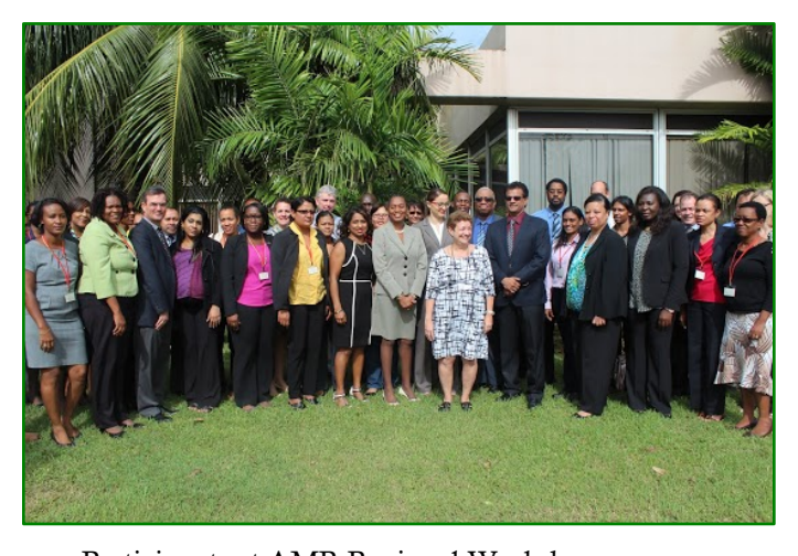
Participants at AMR Regional Workshop